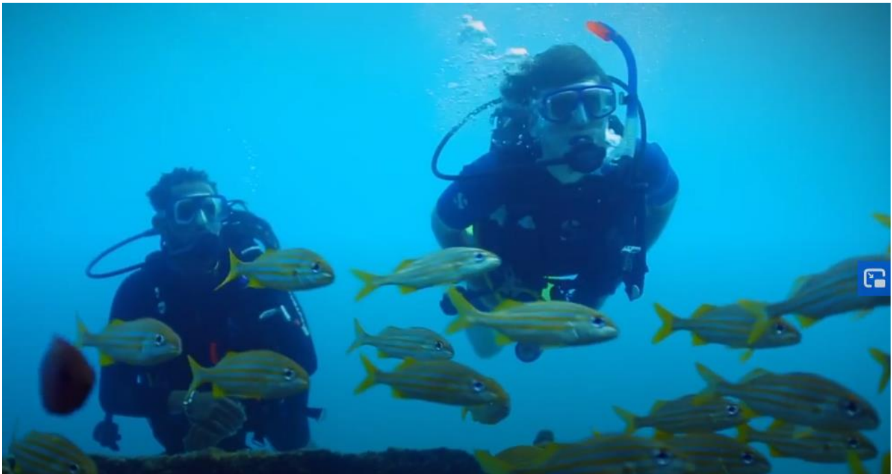
The Caribbean . . . Episode 2